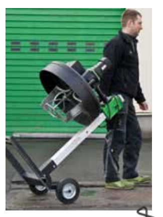
Tipper with 4 wheels, 2 steerable (accessory) – especially designed for clean and precise pouring of self-levelling filler and levelling compounds

Transport carriage with 2 big wheels (supplied) – flexible and mobile at the job site